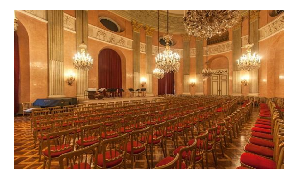
Price: € 150,- p.P. (without guide and drinks).